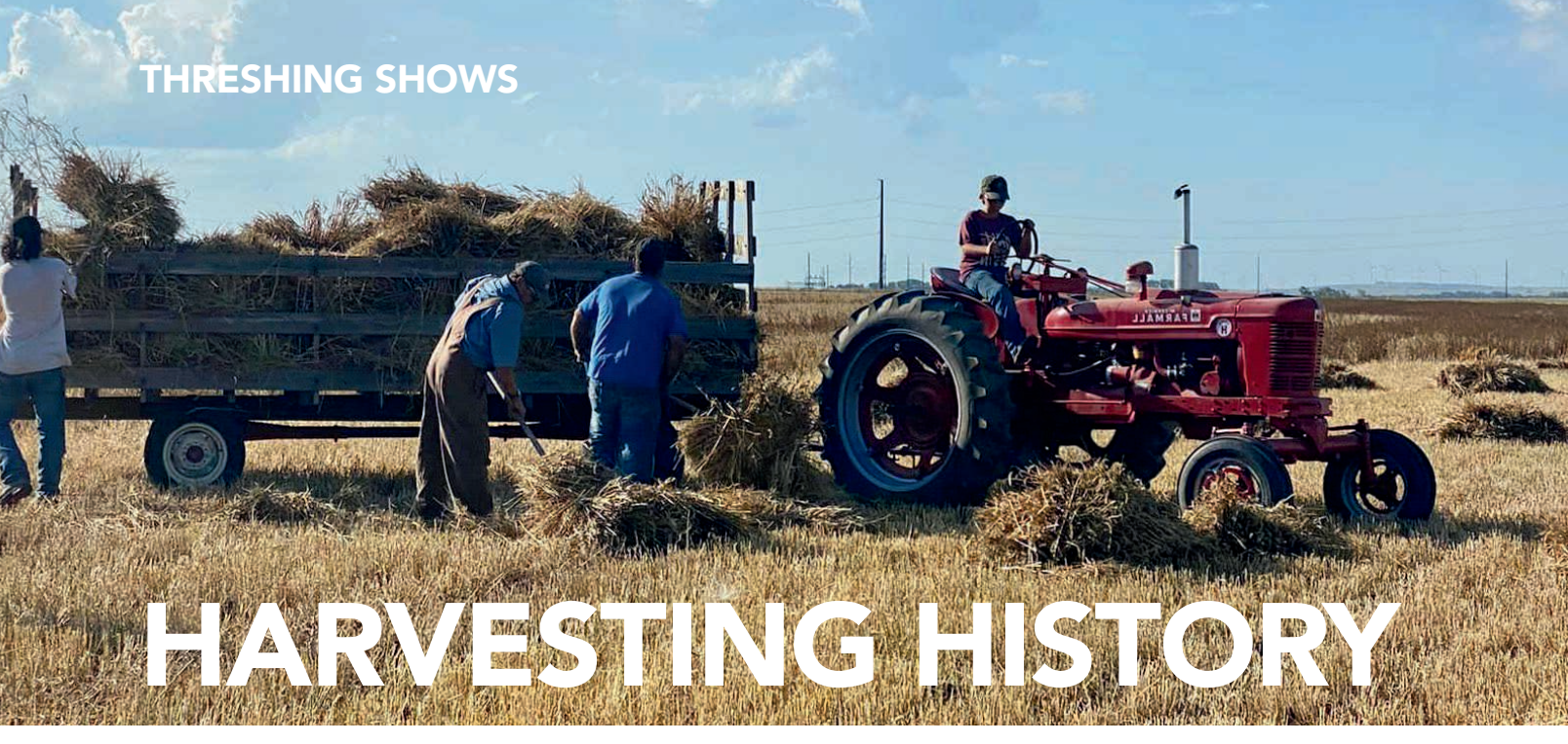
The manual labor of past generations of farmers and ranchers is on display each year at the James Valley Threshing Show each September in Andover.