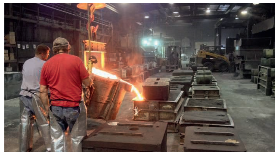
It took nearly 10 years to build a Case 150-horsepower steam-powered tractor from scratch.

Not with the Ladies of Steam. The program is run by women and offers other women a chance to learn about and ride an old-fashioned steam tractor.