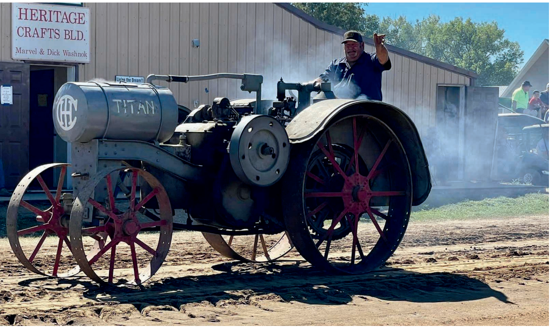
A parade with more than 250 entries each year is one of the most popular events during the James Valley Threshing Show in Andover each September.