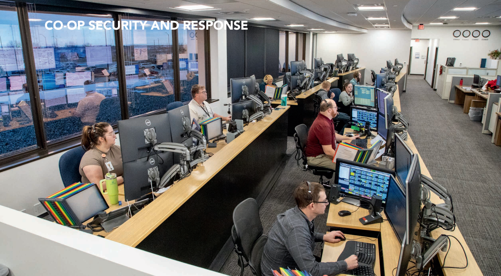
Basin Electric Security and Response Services dispatchers take calls from rural electric cooperative members at Basin's headquarters in Bismarck, N.D.