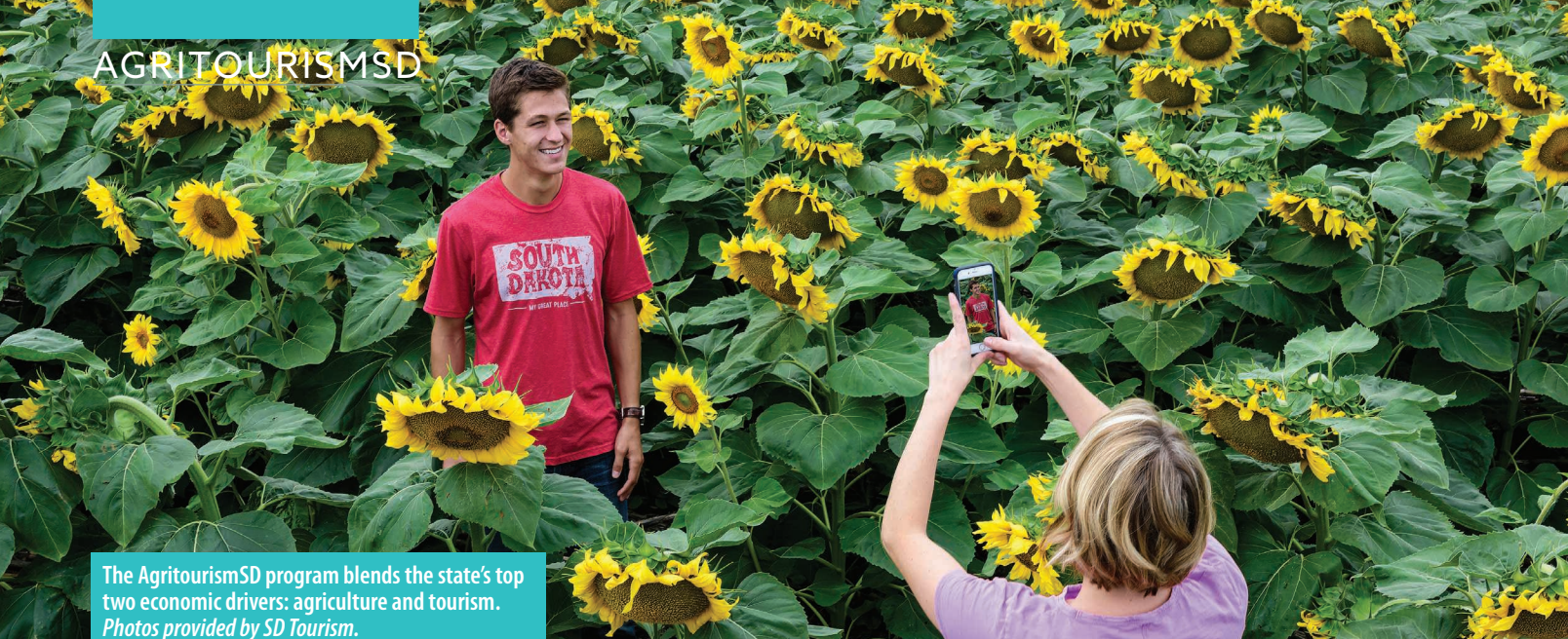
The AgritourismSD program blends the state's top two economic drivers: agriculture and tourism.