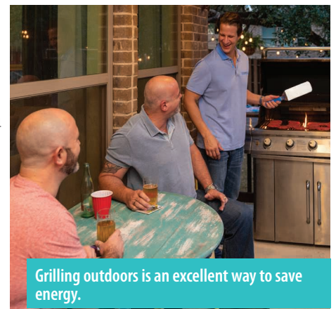
Grilling outdoors is an excellent way to save energy.

Hopefully these ideas will help you enjoy your outdoor living space this summer - and help you save energy!