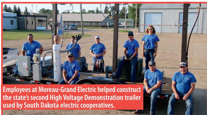
Employees at Moreau-Grand Electric helped construct the state’s second High Voltage Demonstration trailer used by South Dakota electric cooperatives.