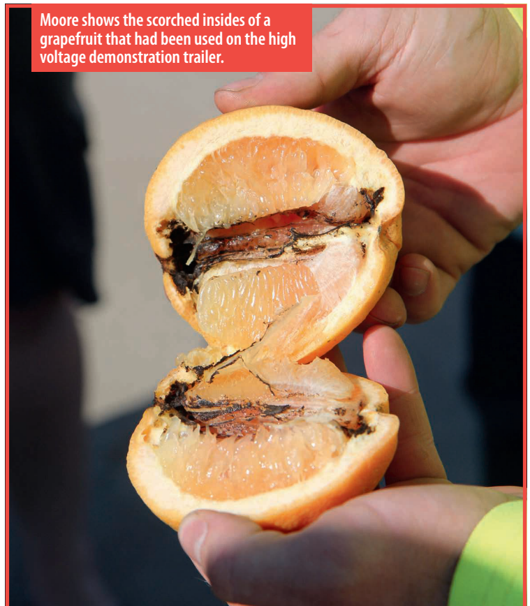
Moore shows the scorched insides of a grapefruit that had been used on the high voltage demonstration trailer.

"This will show you what would happen to your body