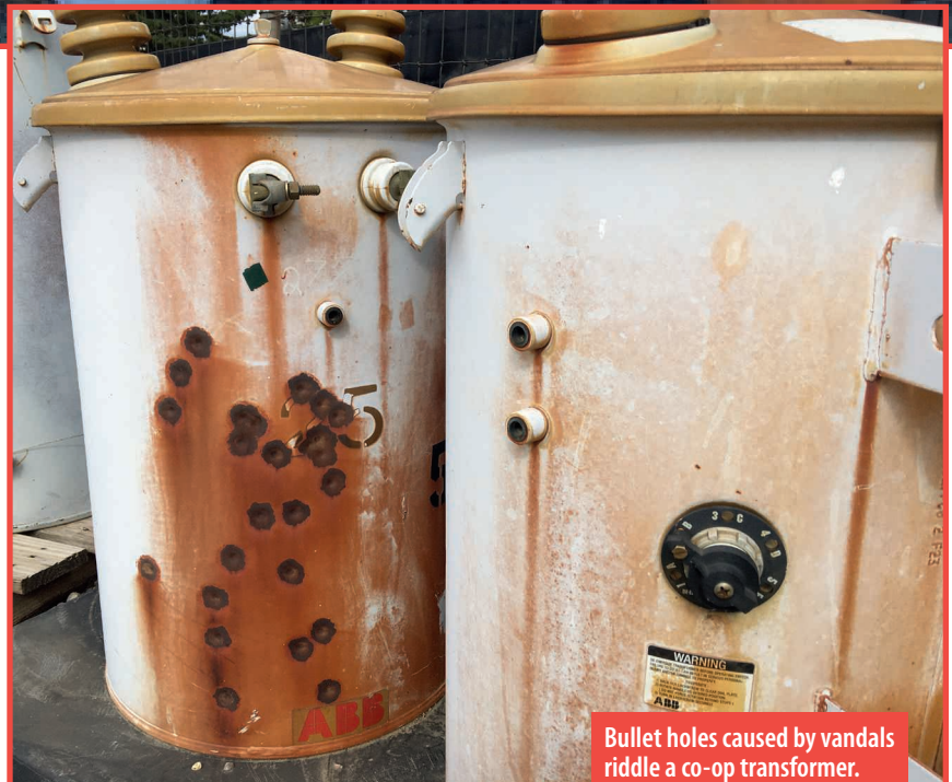
Bullet holes caused by vandals riddle a co-op transformer.