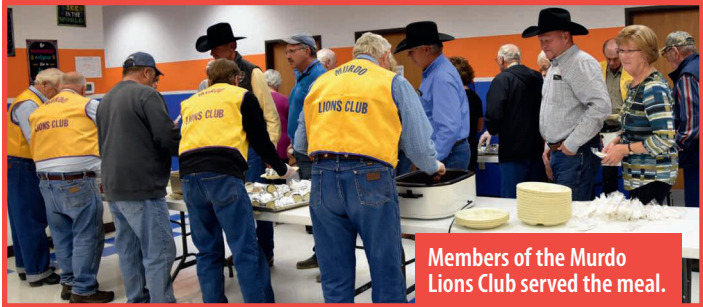
Members of the Murdo Lions Club served the meal.