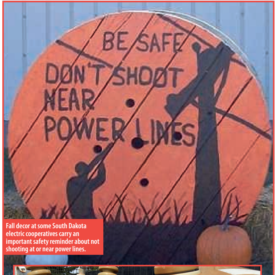
Fall decor at some South Dakota electric cooperatives carry an important safety reminder about not shooting at or near power lines.

"You get really cold weather and the line tightens up and that's when you'll see