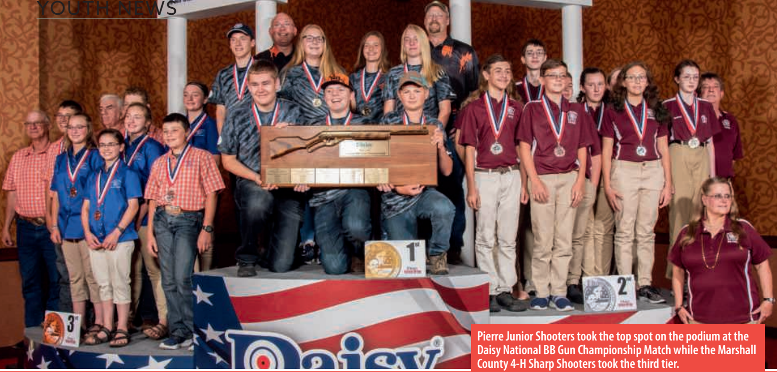
Pierre Junior Shooters took the top spot on the podium at the Daisy National BB Gun Championship Match while the Marshall County 4-H Sharp Shooters took the third tier.