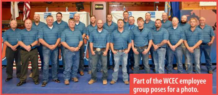
Part of the WCEC employee group poses for a photo.